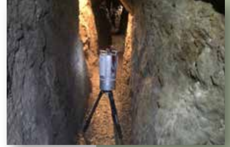
RIEGL VZ-2000i underground 3D laser scanning in caves