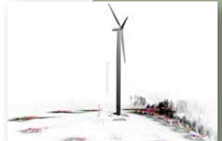
RIEGL VZ-2000i long range scan data