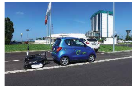
Stream C with vehicle towing kit