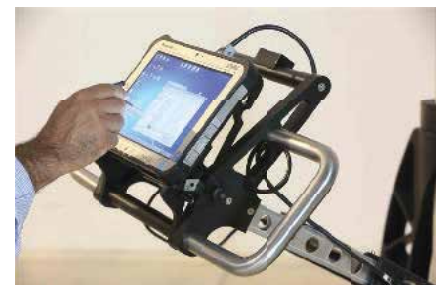
Stream C adjustable handle