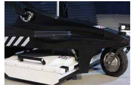
Stream C antenna array