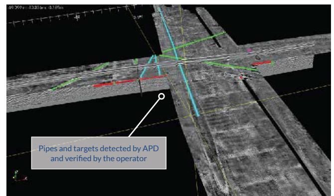
GREED HD 3D CAD: post processing software with pipe results