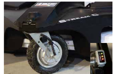
Stream C pivoting and motorized front wheel